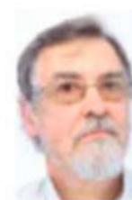
France Secretary General