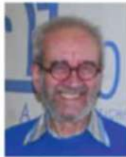
Austria Honorary President