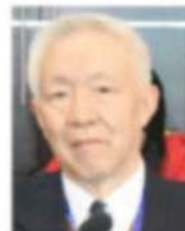
P. R. China Vice-President